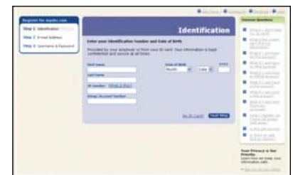
Enter your identification number and Date of Birth or Social Security.