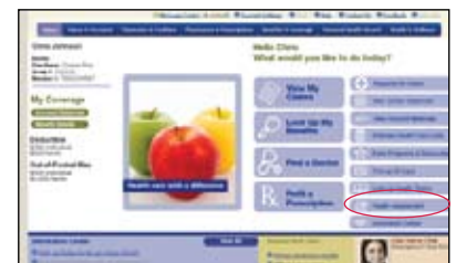
Accessing the Health Assessment

myuhc.com technical support: 1-877-844-4999 8 a.m. – 10 p.m. (EST) Monday – Friday