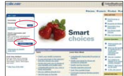
Logging on to myuhc.com