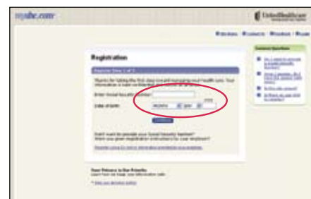
Enter your SSN# and Date of Birth or subscriber ID number.