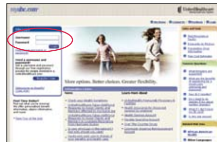
Logging on to myuhc.com