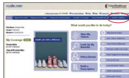
Accessing the Online Coach - “Health & Wellness” tab